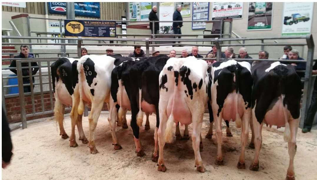
Above: Pedigree milkers in the ring