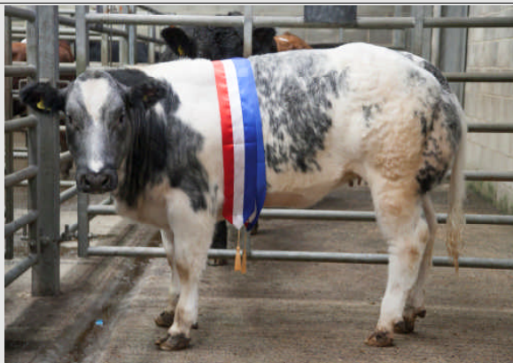
Champion – J & M Townley & Son