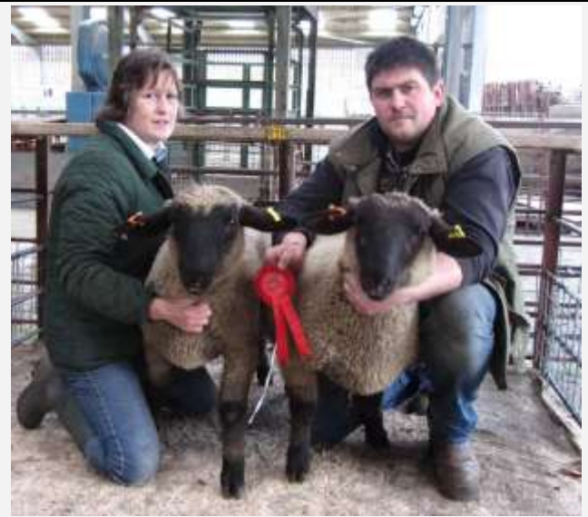
Champion/1 st Single Lamb G A Hewitt & Son