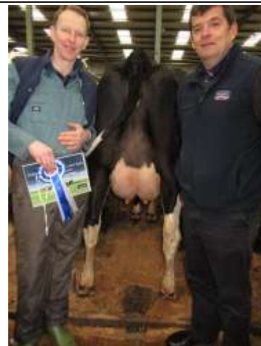
2 nd GD Donkin